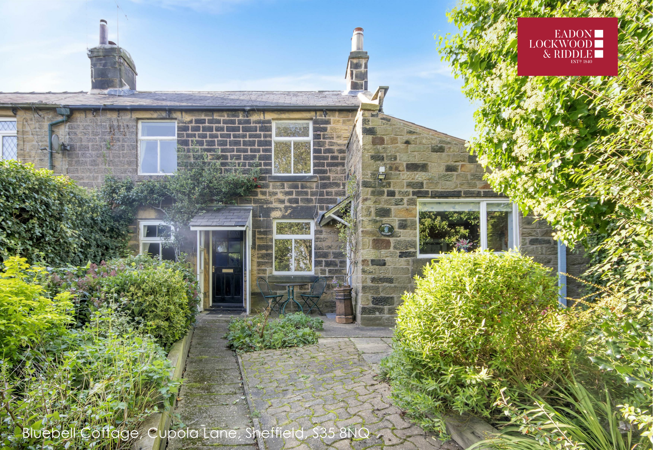
Bluebell Cottage, Cupola Lane, Sheffield, S35 8NQ